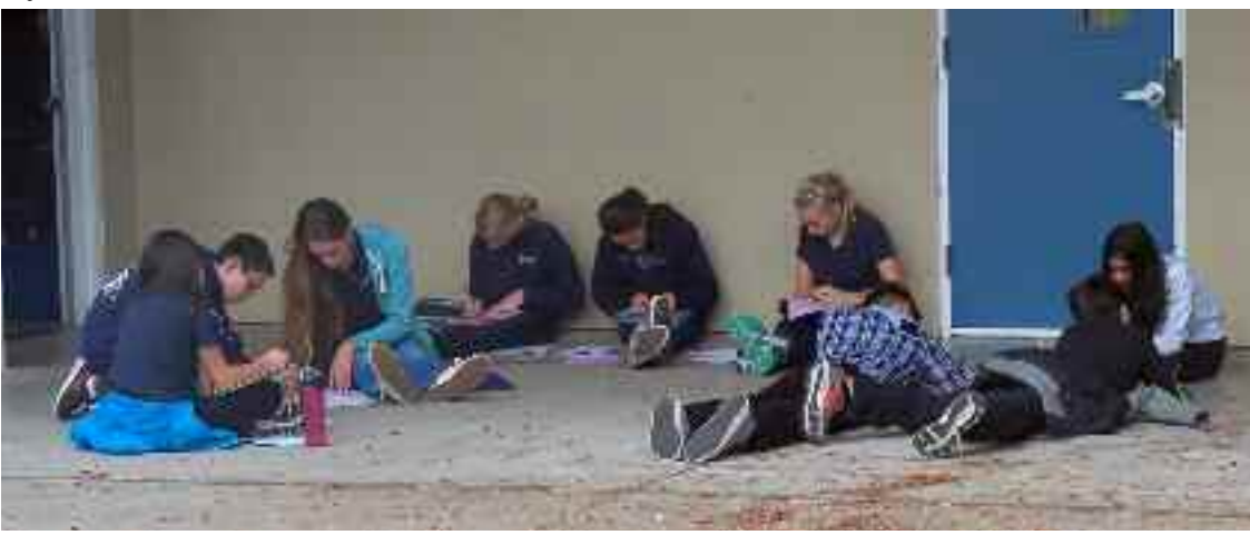
Students prepare for debates at the Oct. 25 tournament held at Joaquin Moraga Intermediate School.